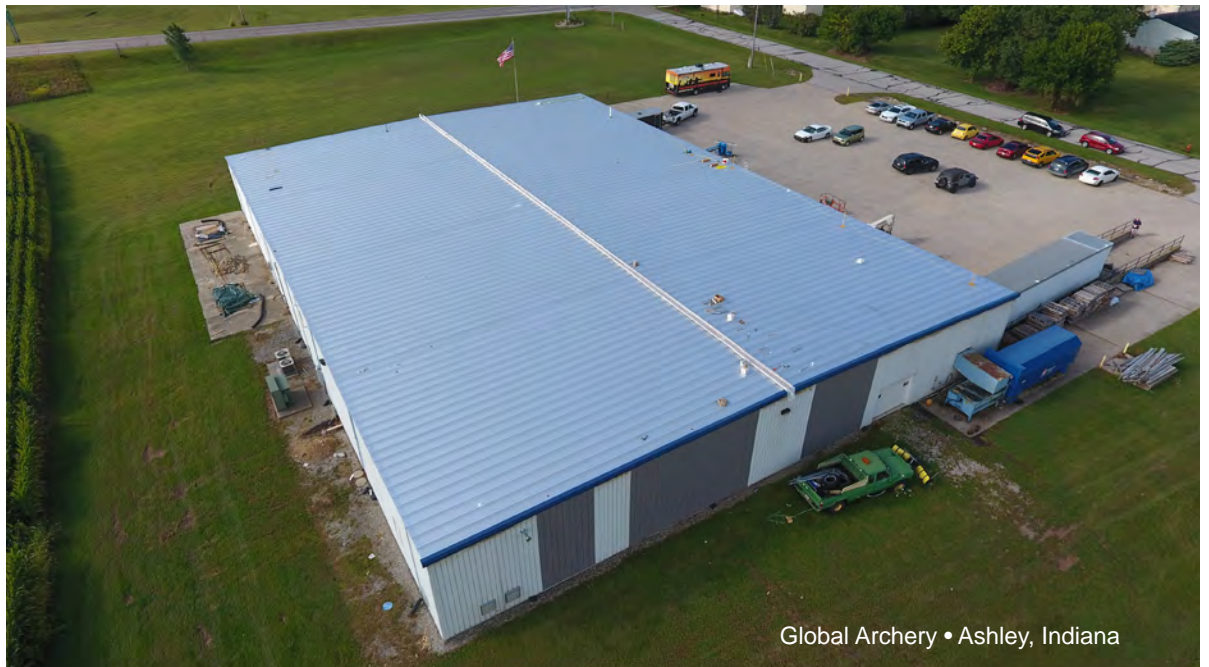
Global Archery • Ashley, Indiana

Global Archery is headquartered in a 1980s-era metal building in Ashley, Indiana. With over 40 years of useful service, this facility's metal roof was in need of replacement. The solution was to place a new metal surface over the existing one. The re-roofing of more than 20,000 sq. ft. was accomplished using structural factory-notched sub-purlins and a 24-gauge, 180-degree roof panel system. The 4.5-inch height of the vintage roof allowed for 6 inches of unfaced fiberglass insulation to be installed between the old roof and the underside of the new one, adding energy efficiency to the facility. The metal-over-metal roofing provides a solution to serve the facility for decades to come.