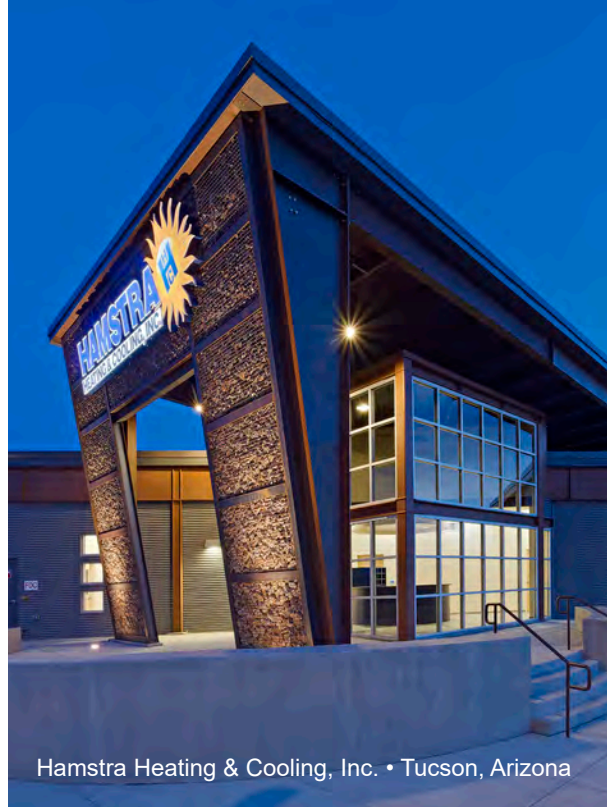
Hamstra Heating & Cooling, Inc. • Tucson, Arizona

Heating and cooling need not be boring. This statement is underscored in the beauty of this Tucson, Arizona structure. Separated into office and display areas, as well as warehousing, the building features a faux rust finish installed vertically on girts, with end walls installed horizontally on inset studs. The canopy is a metal standing seam roof, also with a faux rust finish. The structure is connected to a rainwater harvesting system that incorporates a tank and storage tower.