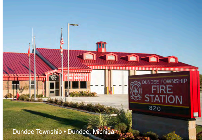
Dundee Township • Dundee, Michigan