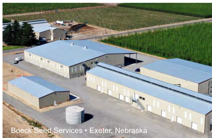
Boeck Seed Services • Exeter, Nebraska