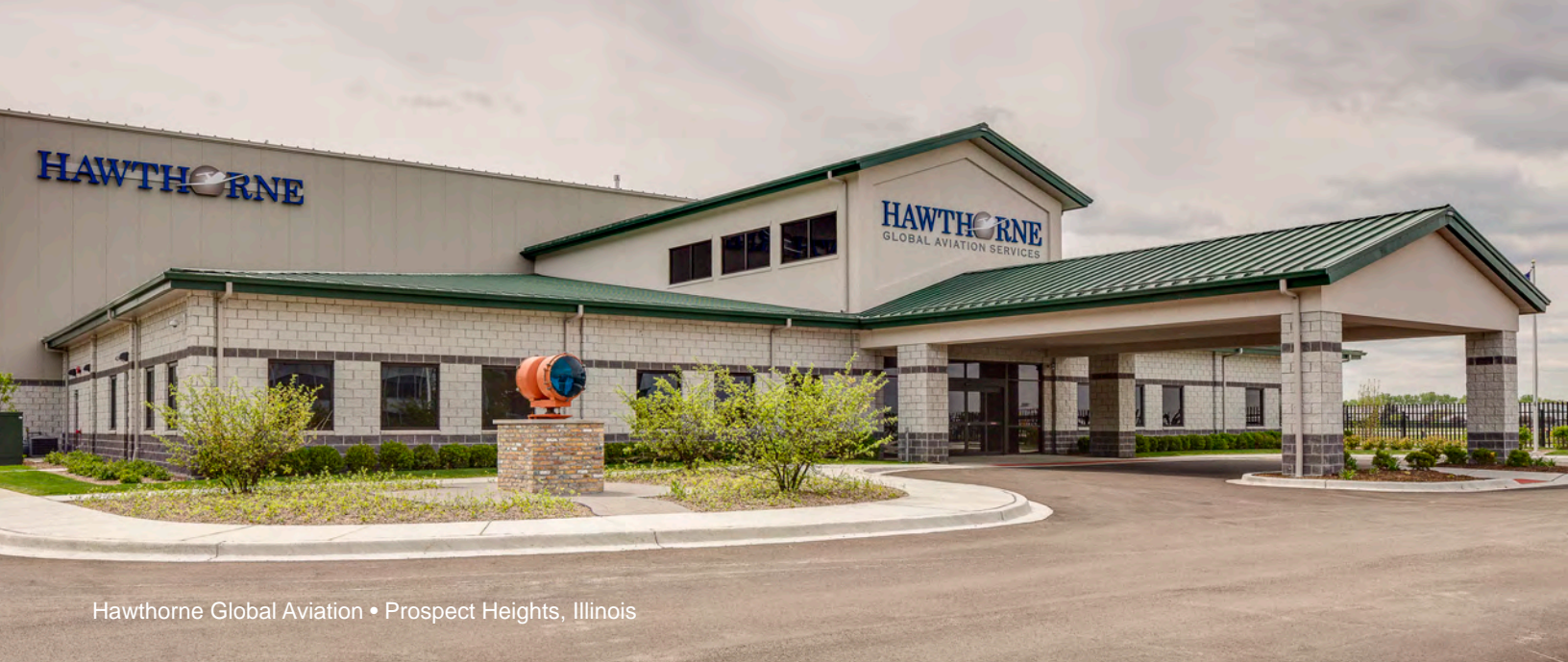
Hawthorne Global Aviation • Prospect Heights, Illinois