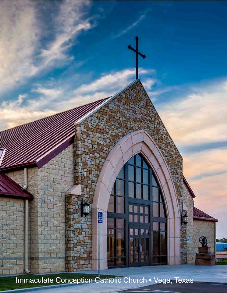
Immaculate Conception Catholic Church • Vega, Texas

In the southeast corner of Michigan, Dundee Township is home to just under 4,000 people. Though small, the community funded a fire station that was not only cost-effective but provided a strong architectural statement. The clearspan, open interior 8,250-sq.-ft. equipment bay provides for vehicle storage and includes a 1,280-sq.-ft. mezzanine. An additional 5,400 sq. ft. provides for offices, a conference room, a kitchen and pantry, and housing for firefighters. The design offers an attractive roof height elevation change, dormers, and cupola—all capped with a bright red metal roof to match the life-saving rescue equipment housed inside.