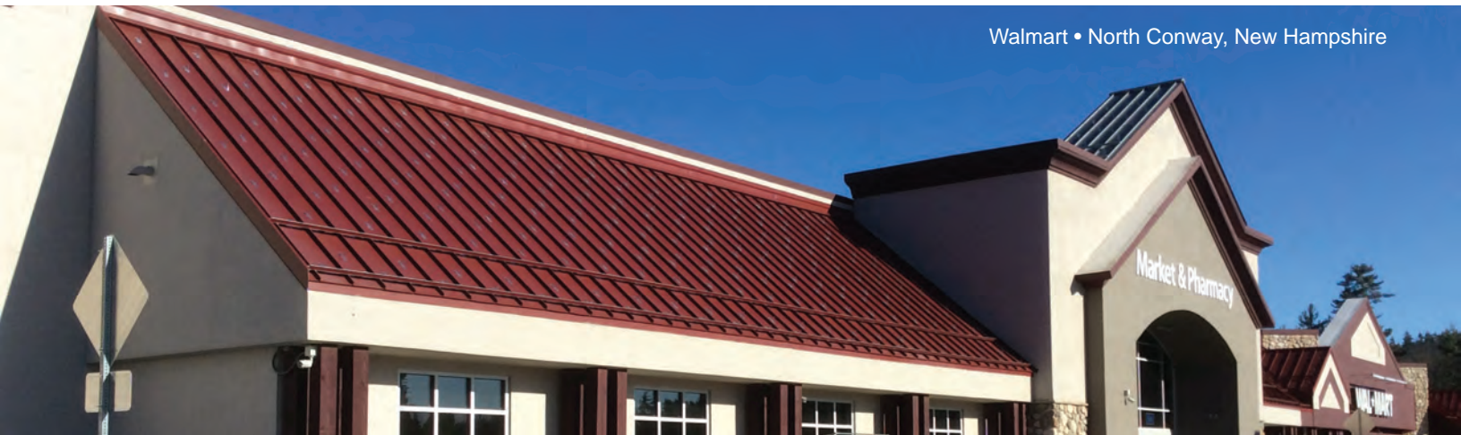
Walmart • North Conway, New Hampshire

An average annual snowfall of 80 inches created problems at the Walmart in North Conway, New Hampshire. Dangerous snow slides occurred, requiring closure on areas around the front entrance to assure the safety of patrons and employees. Walmart's Construction Management group, in coordination with BRR Architecture of Bentonville, Arkansas, and general contractor, Bast Hatfield of Clifton Park, New York contacted metal roof contracting specialist Jottan-Jorel of Evans City, Pennsylvania. Jottan-Jorel completed installation of a high-quality snow retention system onto the existing metal roof in a matter of days that is guaranteed to perform for the life of the roof.