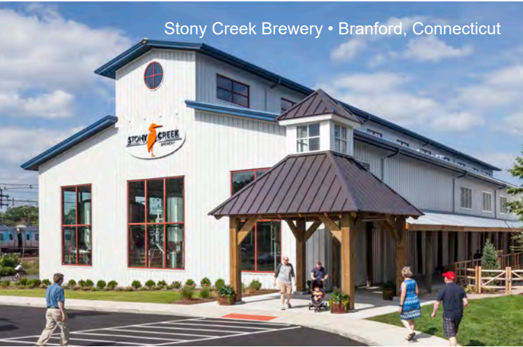
Stony Creek Brewery • Branford, Connecticut

sometimes associated with flat roof systems. The panels also provide a respected retrofit option for built-up and single-ply roof systems. Since the metal panels may be installed directly over an existing roof, this option eliminates costly and time-consuming tear-offs and product disposal.