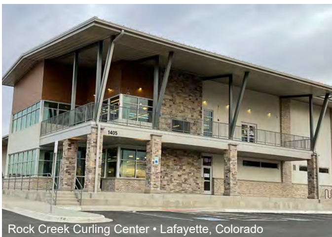
Rock Creek Curling Center • Lafayette, Colorado

Farnsworth's design solution marries the efficiency of a metal building system with upgraded exterior finishes to create both an expressive and efficient facility.