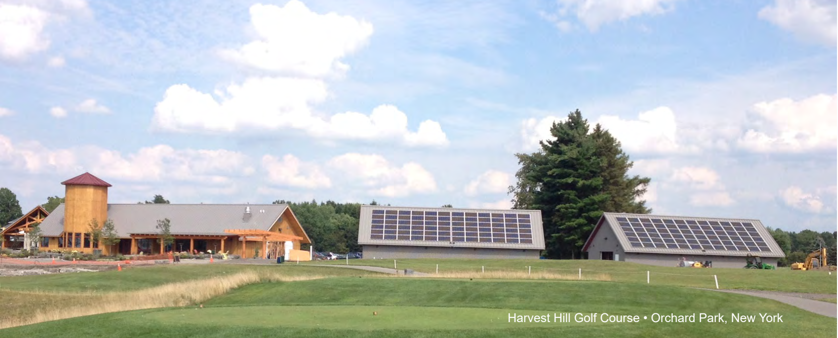
Harvest Hill Golf Course • Orchard Park, New York