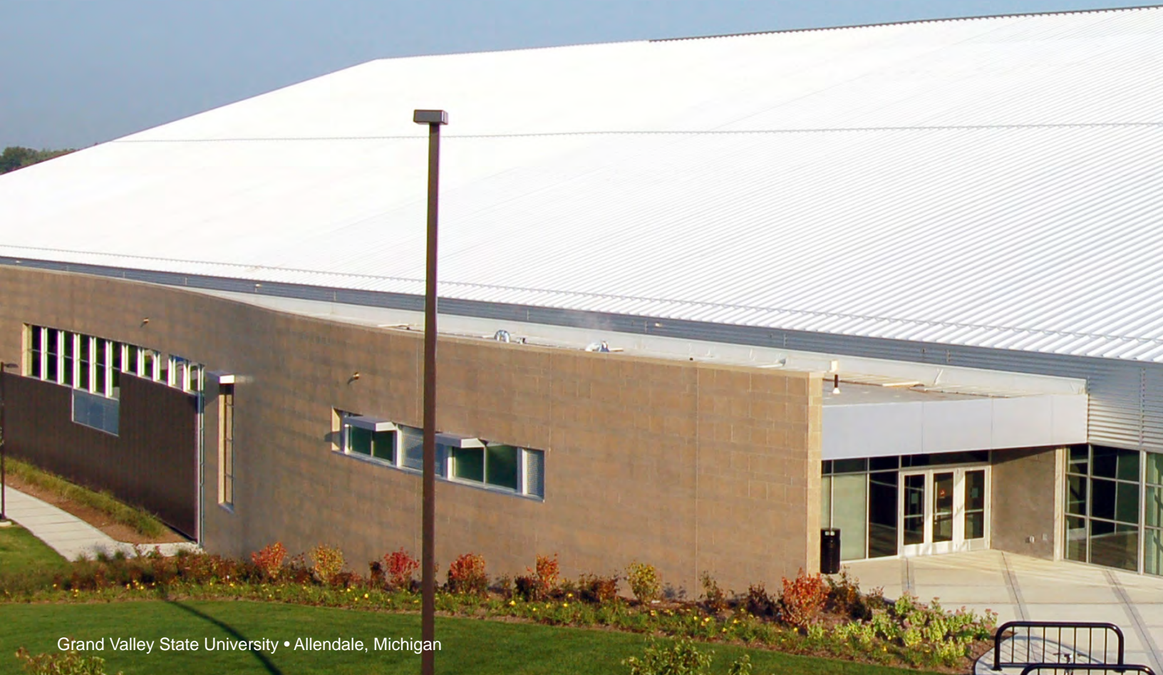
Grand Valley State University • Allendale, Michigan