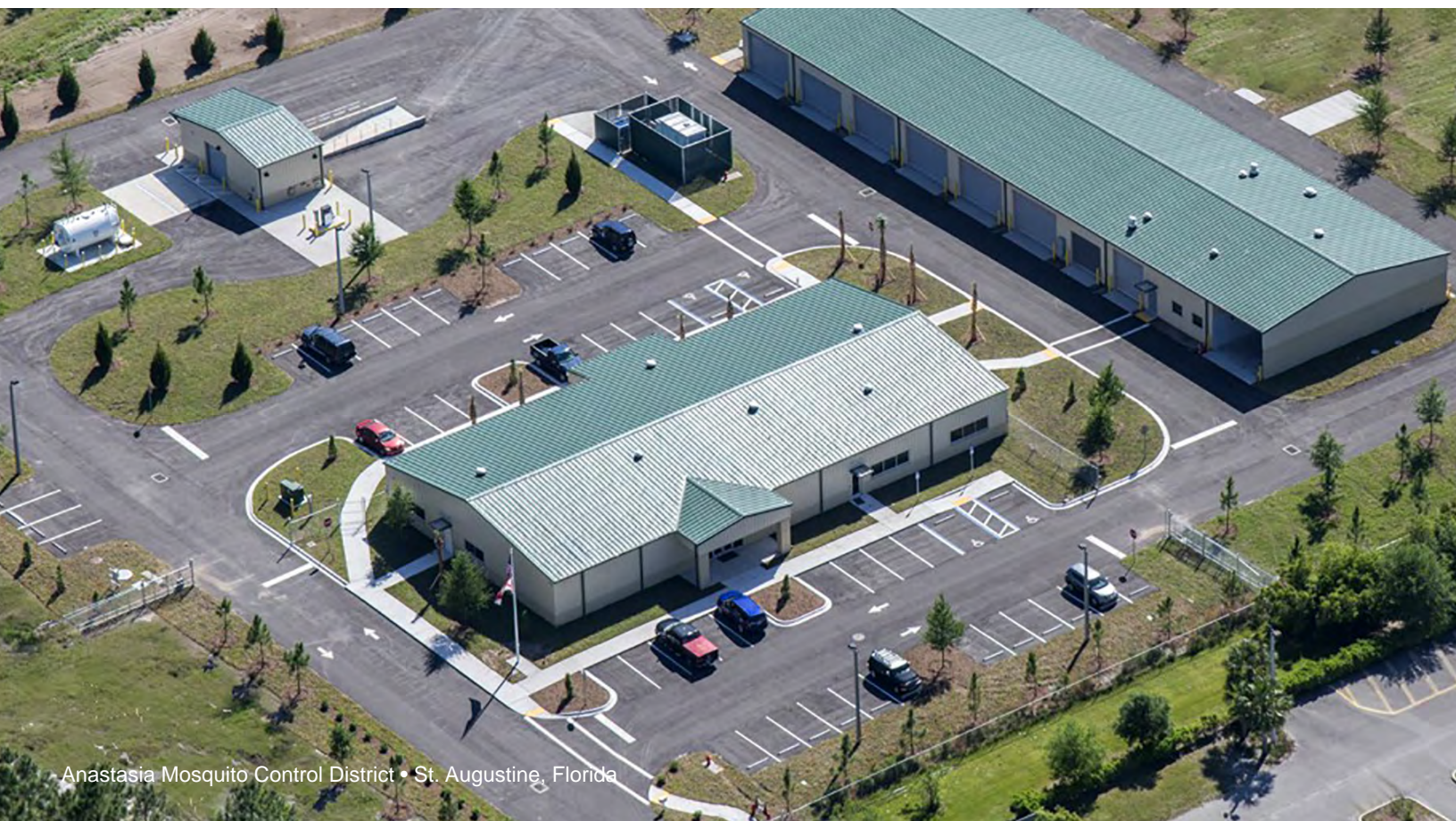
Anastasia Mosquito Control District • St. Augustine, Florida